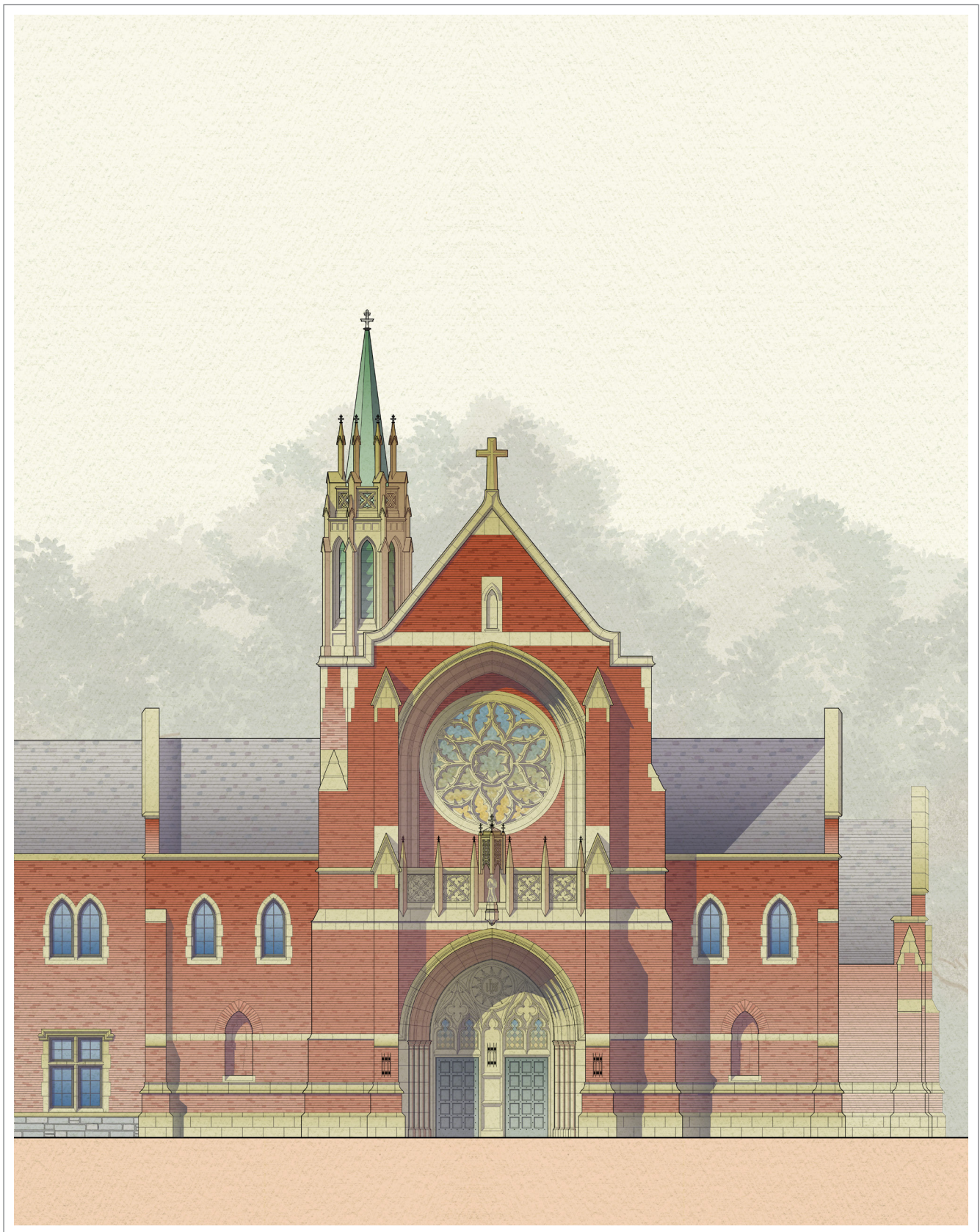
Chapel | Front Elevation