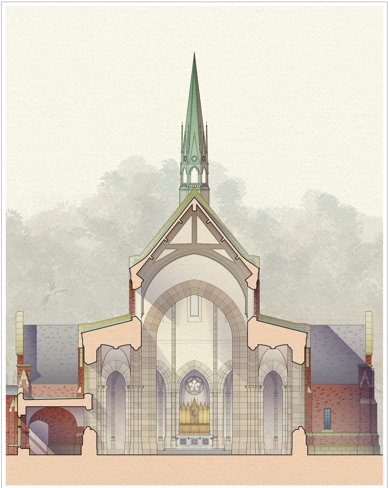
Chapel | Cross Section