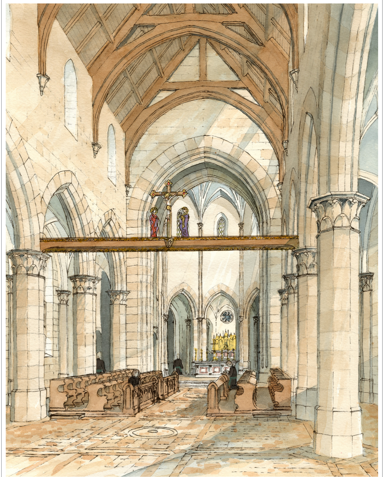
Chapel | Interior Perspective